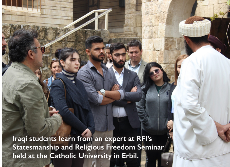
Iraqi students learn from an expert at RFI's Statesmanship and Religious Freedom Seminar held at the Catholic University in Erbil.

challenges in their communities. In 2023, the program supported five projects across four governorates, engaging more than 220 people. Of the participants, more than 85% indicated they were eager to put what they learned into practice. Moreover, millions of youth in the Middle East and North Africa encountered RFI's grassroots social media campaigns like our " We are United " initiative, which promotes religious freedom in messaging tailored to key populations across the region.