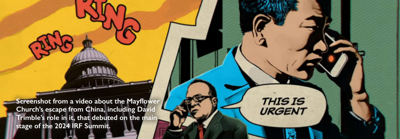
Screenshot from a video about the Mayflower Church's escape from China, including David Trimble's role in it, that debuted on the main stage of the 2024 IRF Summit.